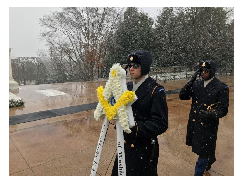
The Military Guard carrying the Masonic Wreath onto the Parade Square in front of the Tomb of the Unknown Soldier.