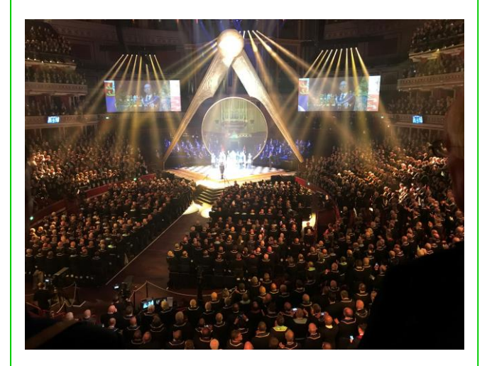
The finale of the UGLE Celebrations