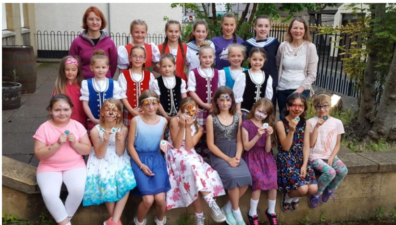
The Chernobyl children after learning some highland dancing.

In July we had our regular annual visit by the Chernobyl children, unfortunately this may be their last visit as the Inverness group are disbanding because the current chairman is retiring and a successor could not be found. Our sincere thanks to the various organisations and businesses who contributed to making the visit a success.