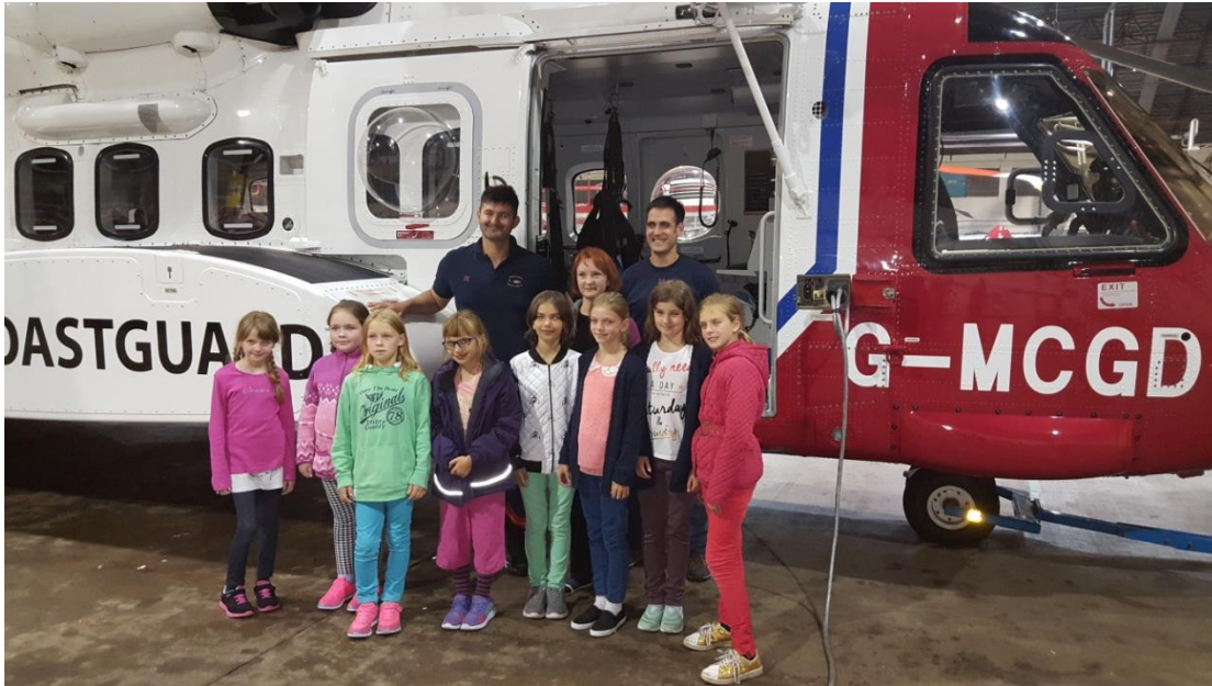
A visit to the coastguard helicopter.