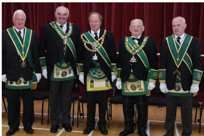
Photographs from the Provincial Installation