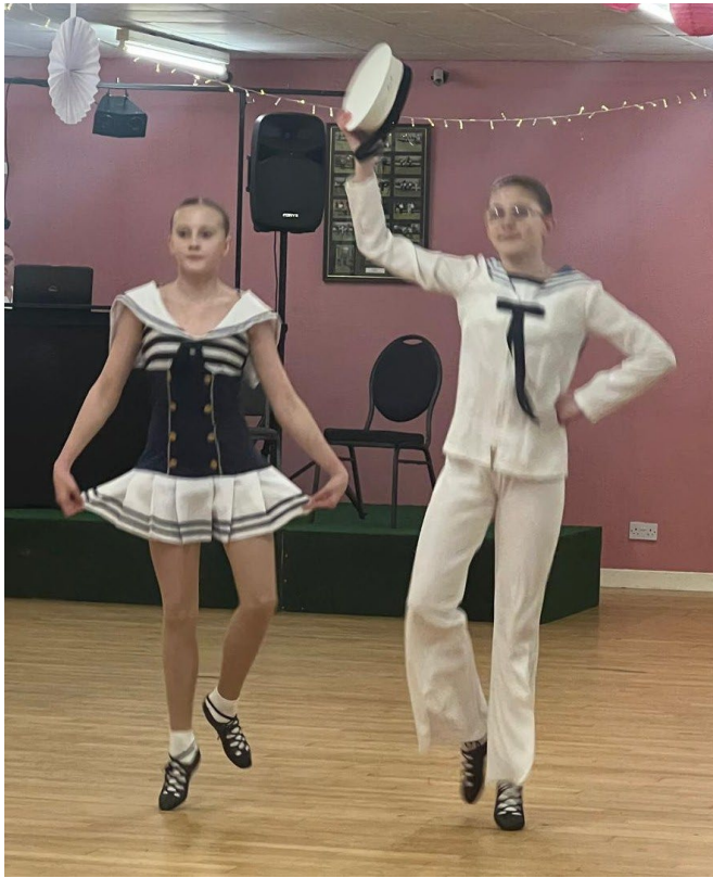
Members of the Anne Noble School of Dance