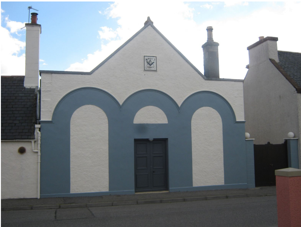
Lodges of the Province – Lodge Ness 888