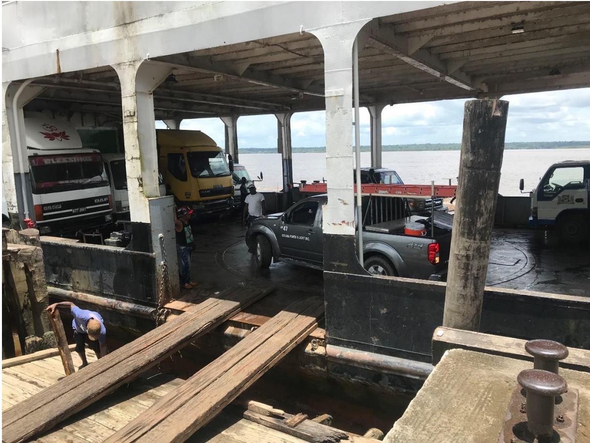
Loading ramp for the car ferry

After an hour on the island, we made our way further up river to the island of Aruwai – home of a holiday resort where we had a very pleasant lunch.