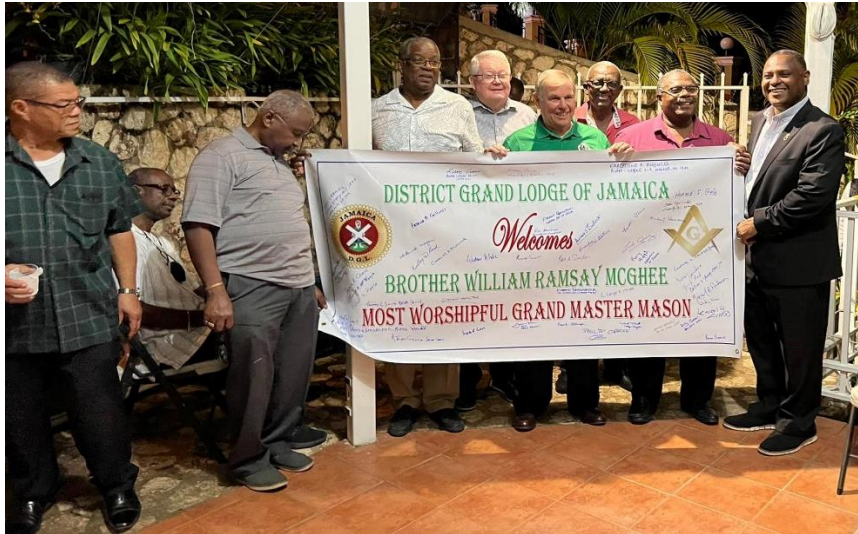
Jamaica welcome poster signed by Brethren and Wives