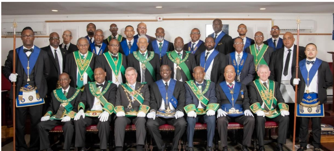
Lodge St David