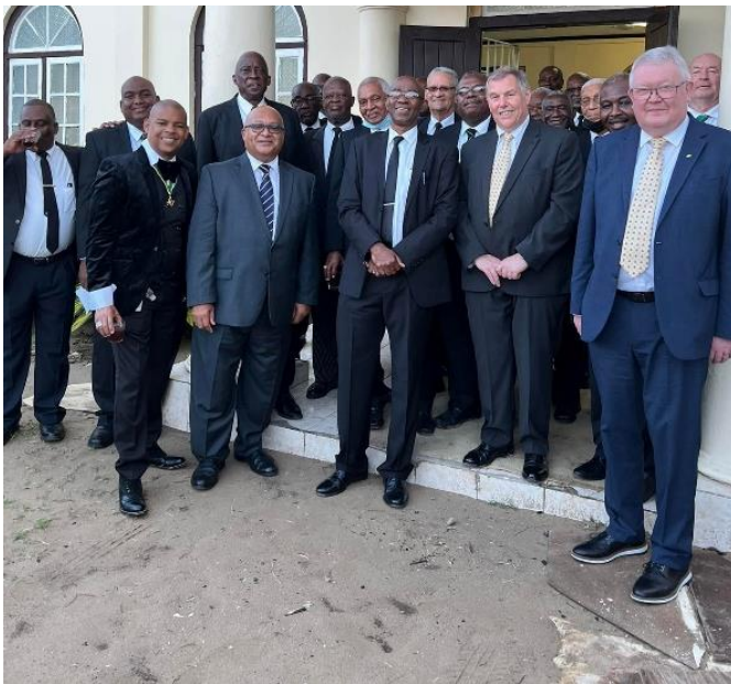
The Brethren of Lodge Caledonian