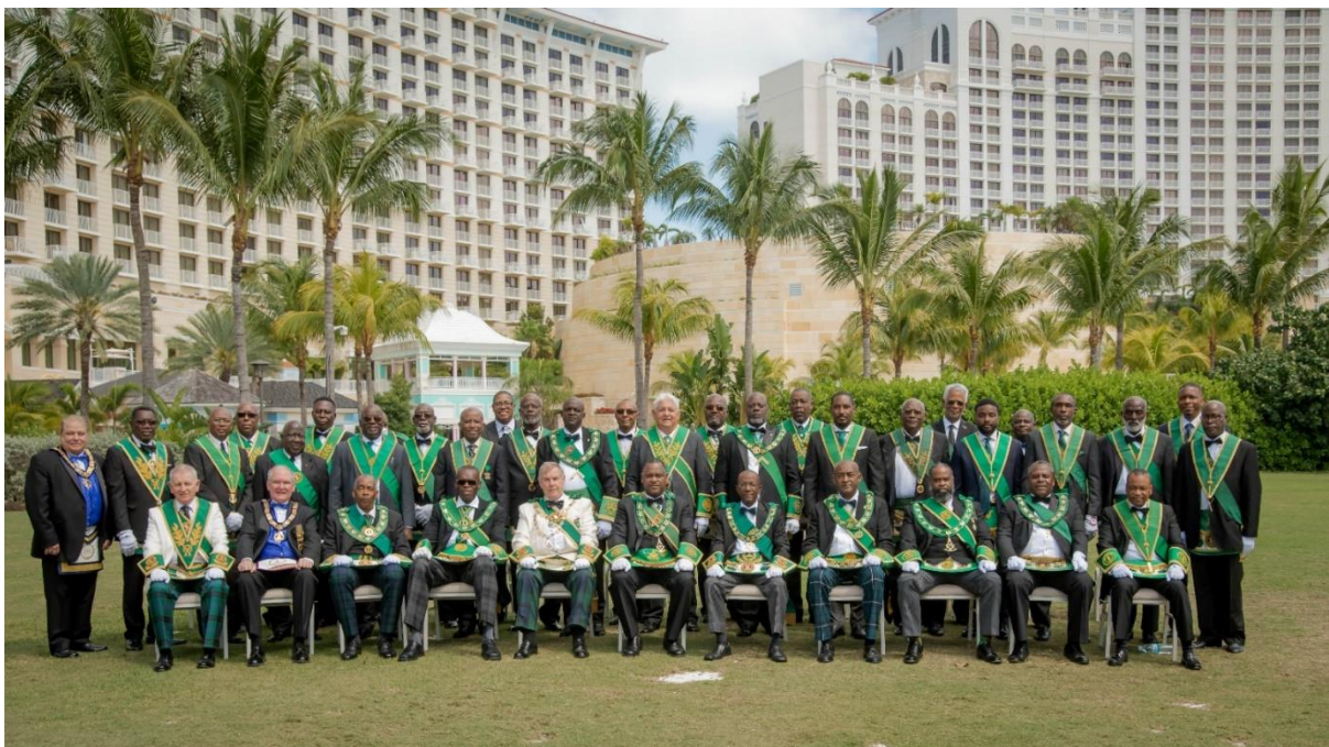
The District Grand Lodge Office-bearers

Saturday 5 th March started with a full-blown rehearsal for the Installation.