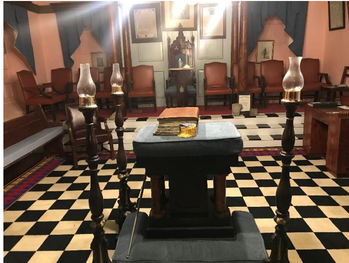
Lodge St George 200

It was a fascinating tour, full of history and a great joy to be able to visit each Lodge on the Island. Finally, it was back to the hotel late afternoon to freshen up before making to the Bermuda Police Service Officers Mess where I was privileged to meet with several Brethren all of whom had some connection to the Police. When I got back to the hotel it was down to work, armed with the result of the antigen test to get a travel health visa for Bahamas.