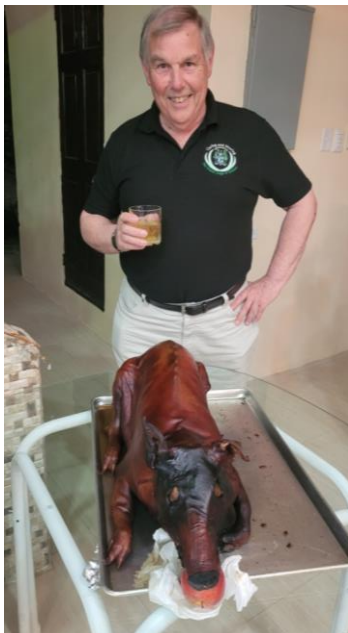
Suckling pig for supper on our arrival