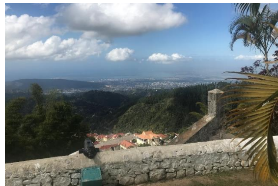
View from the Officer's Mess

We started off the visit with a very tasty Jamaican style breakfast followed by a photograph session from the hill-top post and then a very informative visit to the Military Museum.