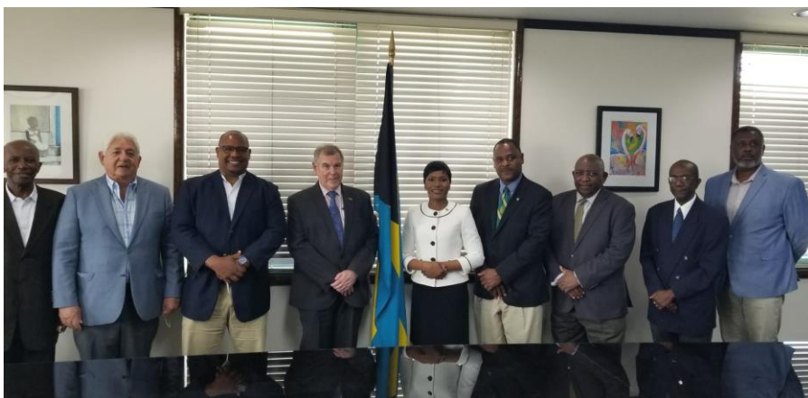
Meeting with Minister for Grand Bahama, the Honourable Ginger Moxey

We were driven to Pelican Bay resort where we got booked into our rooms and then congregated for a Bahama style breakfast before leaving for the Government buildings where we met the Minister for Greater Bahama, Ginger Moxey – a charming lady who has a large and diverse portfolio to deal with.