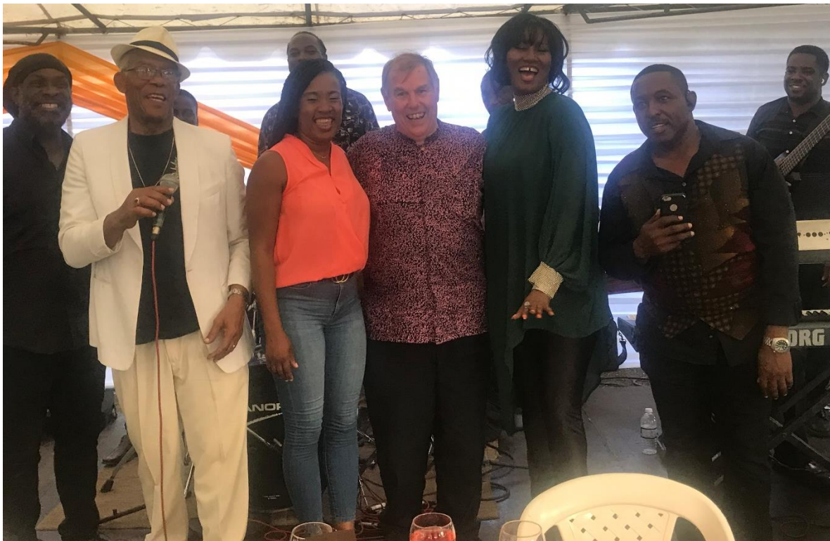
With the musicians who entertained all afternoon at the Brunch