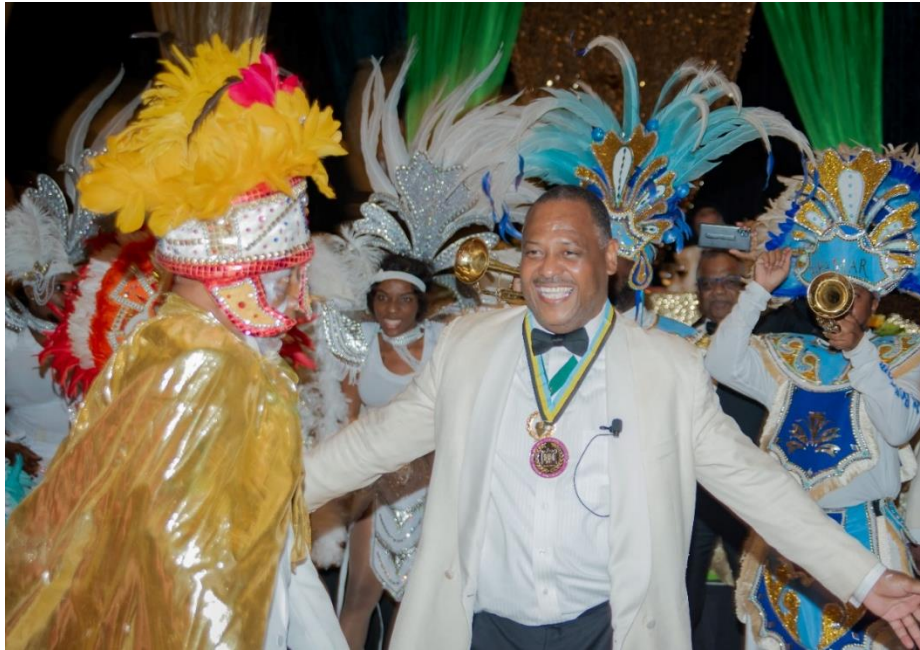
The Junkanoo and the DGM getting into the swing of things

The splendid meal was enjoyed by all and was followed by numerous Toasts and responses, but the highlight of the evening was the world-famous Valley Boys & Junkanoo participants. A spectacular extravaganza of Bahamian music and culture,