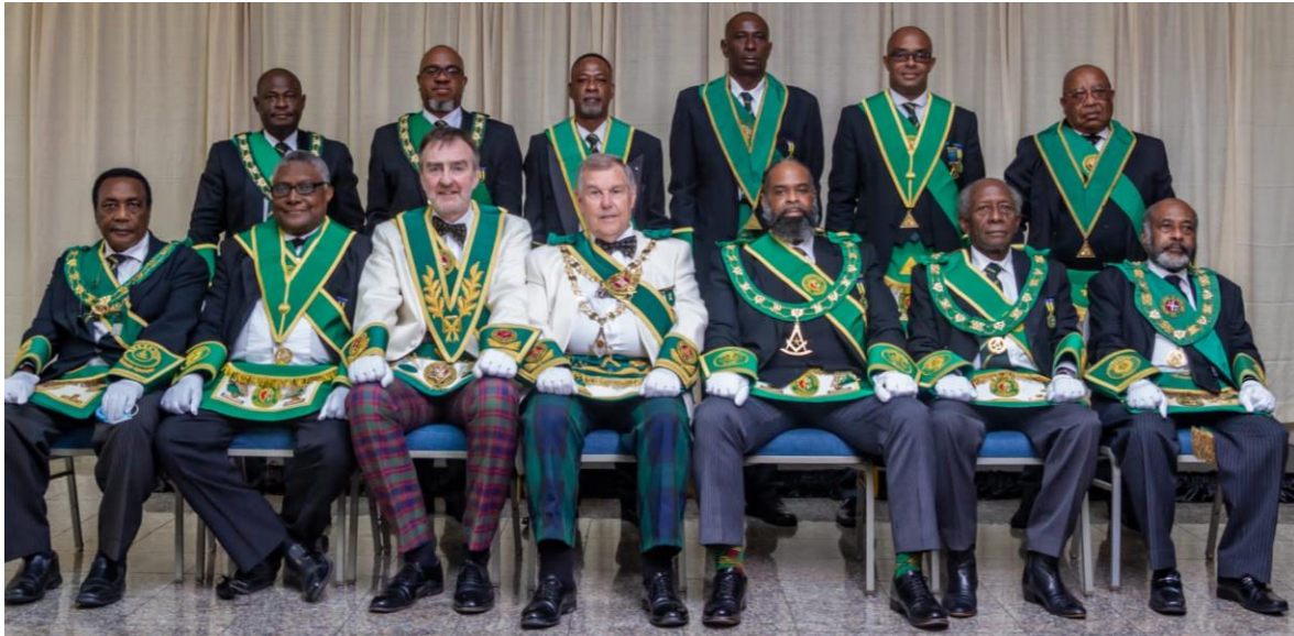
District Grand Lodge of Barbados

We had ample time after the Ceremony to return to the hotel, get changed and back again for the Banquet in the evening. A splendid affair with a buffet comprising excellent local dishes. Again, the Caribbean tradition of singing at each toast was carried out.