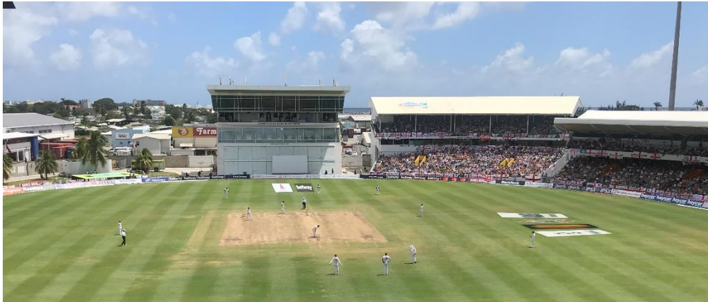
Kensington Oval, Barbados

What a lovely day we had, enjoyed the cricket, the company, the hospitality and was delighted when I was given the opportunity to be introduced to Sir Garry Sobers.