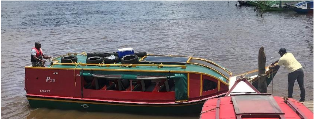
Our boat for the day

First port of call was Fort Island, previously known as Flag Island or its Dutch translation Vlaggen Eiland. The island was at one time a Dutch trading outpost with an unsavoury history of slavery. Today, the island is inhabited by a small population but it has a nursery and primary school and a health centre.