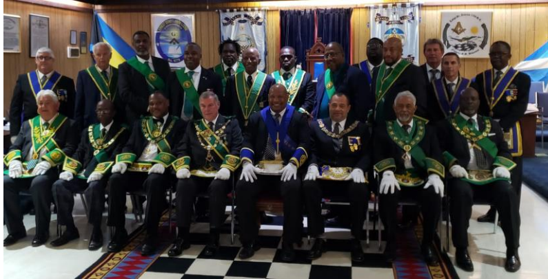
Lodge St Andrew