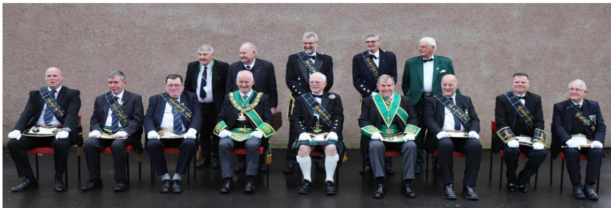
Seaforth Members at the December 2021 Installation Meeting