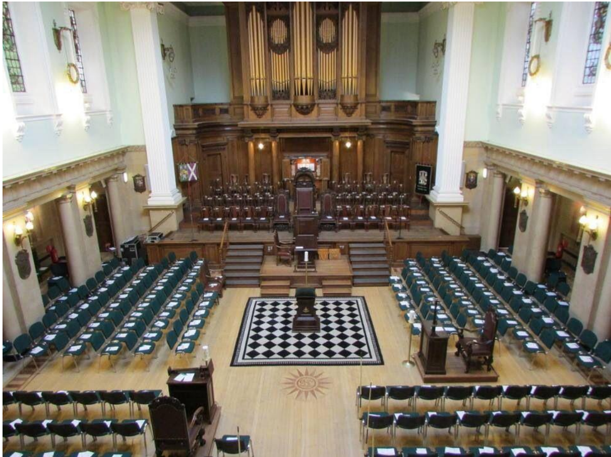
Grand Hall – Grand Lodge of Scotland

The Quarterly Newsletter of the Province of Ross and Cromarty