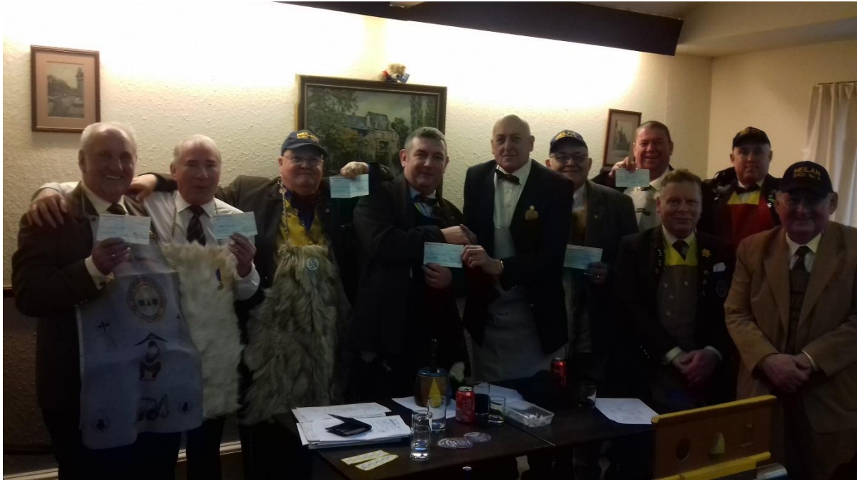
Recipients of cheques for a range of worthy causes