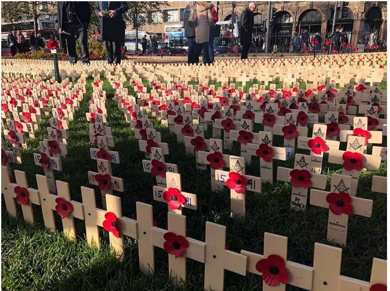
The Masonic Section of the Garden of Remembrance in Princes Street, Edinburgh