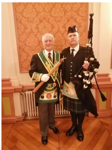
Father and Son