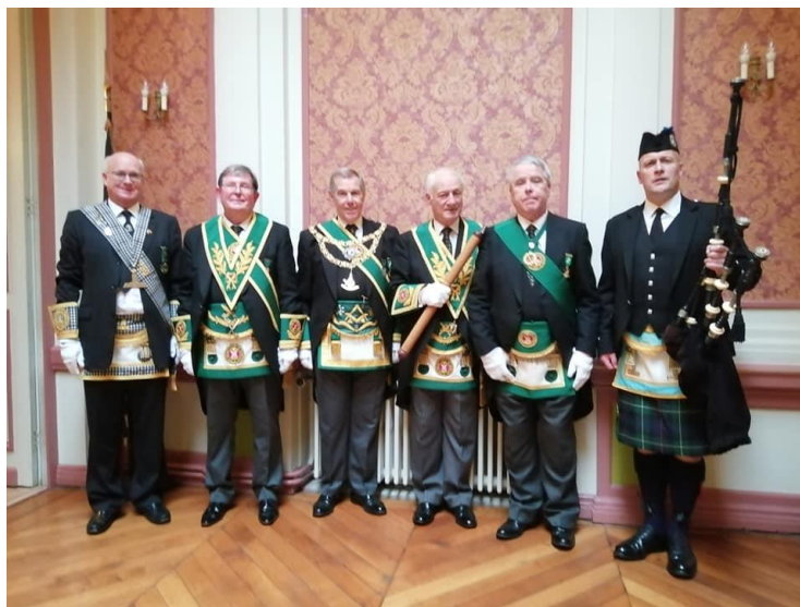
The Deputation from the Grand Lodge of Scotland