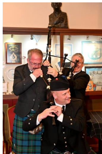
Belgian Piping Lesson