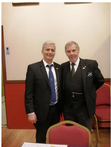
GMM and the Candidate